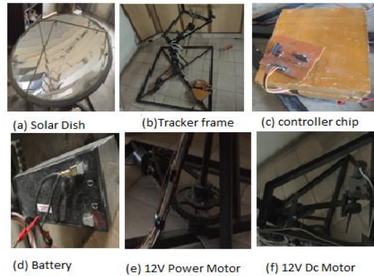
Fig. 4. Prototype Parts.