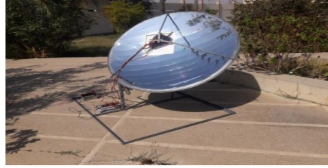
Fig. 1. Designed Prototype.

For Pakistan, in rural or desert areas where sunlight appears invariably under seasonal mode, the desired system is proposed to capture the solar irradiance in regular and seasonal mode. With high reflective glass material the heat collection is merged under a single focal point of parabolic dish [11, 12]. The maintenance of solar dish elevation angle and tilt angle is done through LDR actuators and power window motors. The whole tracking of proposed parabolic solar dish is based on Arduino based chip board that regulate the whole system in optimal and efficient mode. The power running actuators get their startup power service from an external battery to improve the remedies of sensor mechanism. The designed automated dual axis tracking prototype is capable to attained high temperature applications like as hot water & steam generation. As in previous research of dual axis the system rotates with their both operative modes which make the tracker slower in perception of heat measurement and sensor functioning so, to improve this state of sensor the optional mode is included in designed parabolic dish prototype that is tested at Indus University Karachi with Latitude 23.9207°N and Longitude 67.0882°E which gives you option to run your dish on single axis or both axis as suitable with your application area.